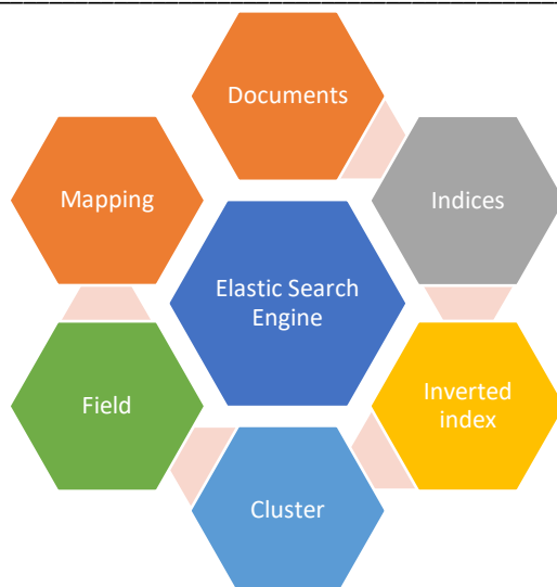
Figure 1 Terminology used in Elastic search engine.